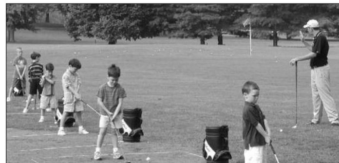
Moraine and Mini Moraine Day golfers in June